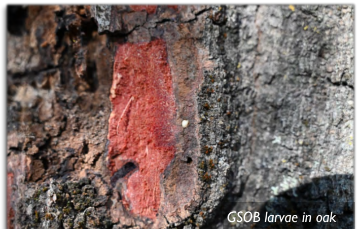
GSOB larvae in oak

This year was also spent working on the CAL FIRE Forest Health Project. Our project "Saving San Diego's Last Mixed Conifer Forest" continued its collaborative approach to manage and protect the health of our forests and watersheds to ensure their resilience against future wildfires, while promoting increased carbon storage across ~1,575 acres on Palomar Mountain. Our group of 5 state, federal, tribal, and private landowners are implementing active fuels reduction, and forest reforestation. This unique project has multiple sustainable benefits to Palomar Mountain that improve forest health, wildlife habitat, and community protection.