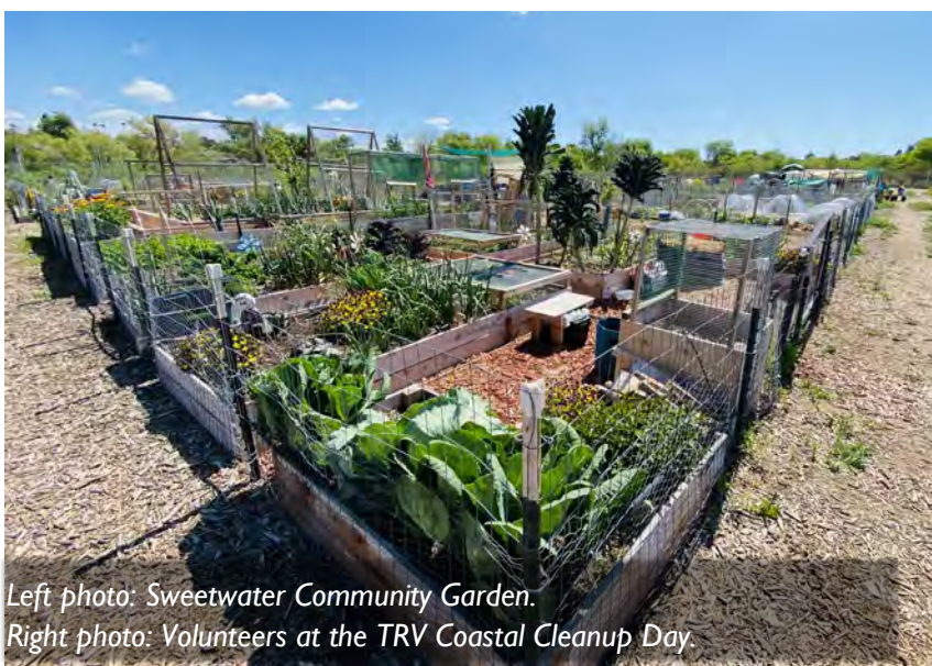
Left photo: Sweetwater Community Garden.

In 2021, our Sweetwater Community Garden in Bonita continued to flourish and created a new space for those who want to grow their own food. We continued to fill the plots this year and gained a total of 60 new gardeners! We were able to team up with the Solana Center to significantly improve the communal composting system, host two public composting workshops, and train gardeners to facilitate proper use of our composting system. Want to rent a Sweetwater Garden plot? Call our office at 619-562-0096.