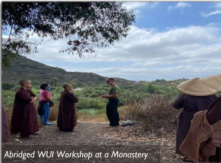
Abridged WUI Workshop at a Monastery

We continued our outreach campaigns this year by participating in five safety fairs and other community events.