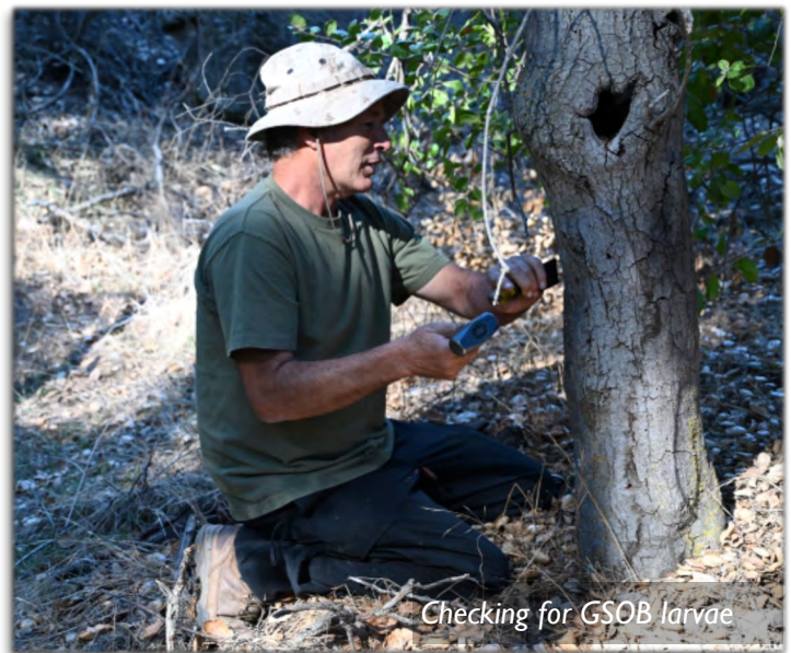
Checking for GSOB larvae

This year was also spent working on the CAL FIRE Forest Health Project. Our project "Saving San Diego's Last Mixed Conifer Forest" continued its collaborative approach to manage and protect the health of our forests and watersheds to ensure their resilience against future wildfires, while promoting increased carbon storage across ~1,575 acres on Palomar Mountain. Our group of 5 state, federal, tribal, and private landowners are implementing active fuels reduction, and forest reforestation. This unique project has multiple sustainable benefits to Palomar Mountain that improve forest health, wildlife habitat, and community protection.