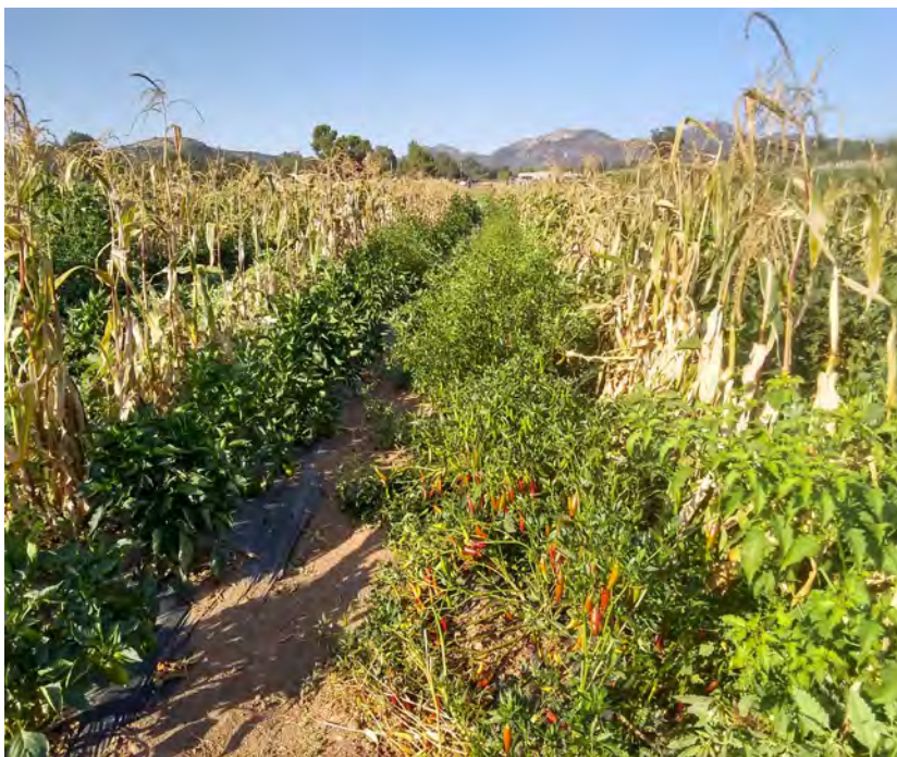
Left photo: Pollinator plants at Solidarity Farm