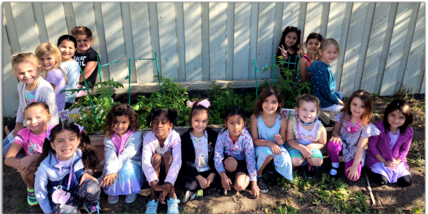
Our annual plant giveaway supports hundreds of school gardens throughout the county. Above are students from Winter Gardens Elementary who planted their vegetables from the event..

In 2021, we worked hard to bring free plants to schools and families who were working to reintroduce gardening into their curriculum and had the most successful Plant Giveaway to date.