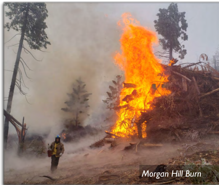
Morgan Hill Burn