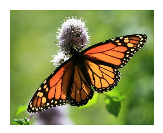
Annual Report 2015